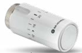
IMI Heimeier range of thermostatic heads