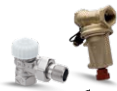
V exact II & STAP