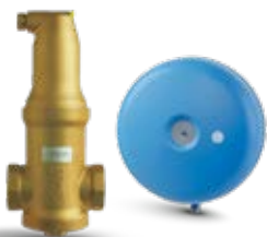
Zeparo air separators & Statico

Please consider replacing the thermostatic heads to ensure better performance