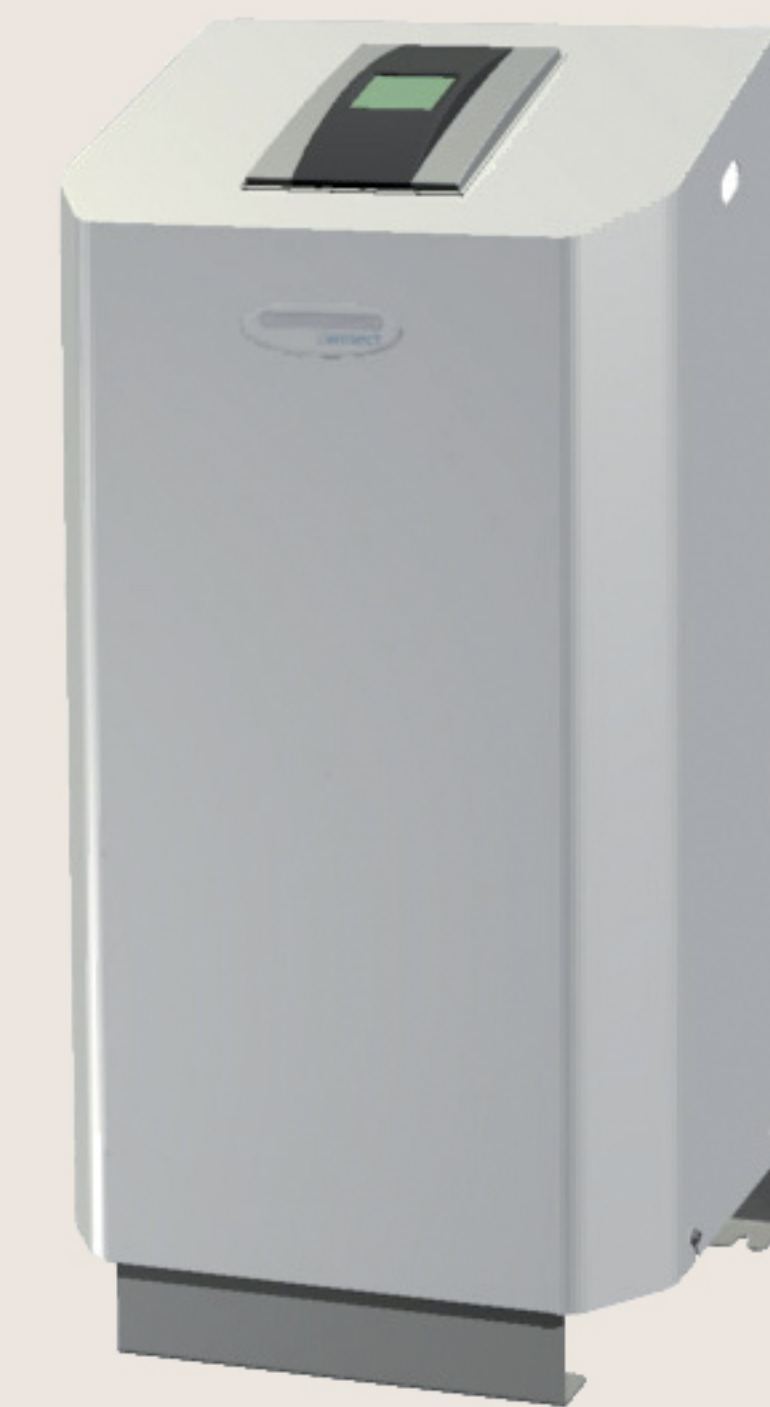
Vento Connect degasser

System noise is really upsetting to tenants but can be easily prevented. By removing the air circulating in the system you fight noise and stop the formation of dirt particles that compromise system efficiency.